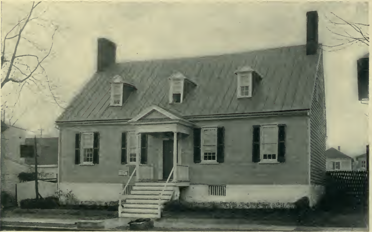
RISING SUN TAVERN, FREDERICKSBURG, VIRGINIA

There is a beautiful hall and stairway. All bedrooms have slanting ceilings. Washington slept at this place when he came to visit his mother